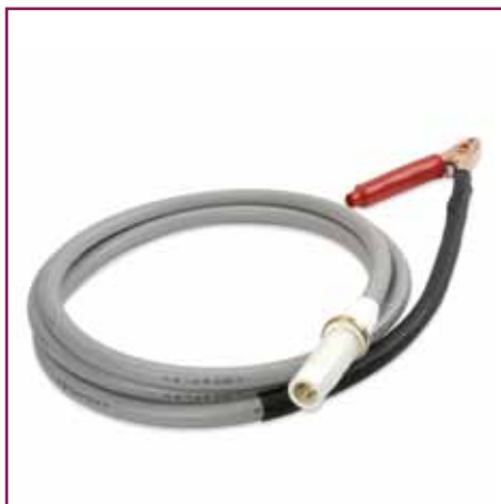
High Voltage Cable

The VBT-60 is furnished with a 10-foot test cable that is terminated with a quick-disconnect test clip. A transportation case is also included.